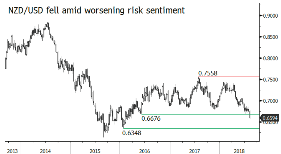
NZD/USD fell amid worsening risk sentiment

Overall, the greenback appreciated sharply against all of its peers, with the exception of the Japanese yen that is protected by its safe-haven status, amid raising protectionism fears, no-Brexit deal and rising tensions in Turkey. The Kiwi was no exception and has been hit hard by the deterioration of the risk sentiment. We remain convinced this is a spontaneous reaction and that the market will return to normal as the risk sentiment improves.